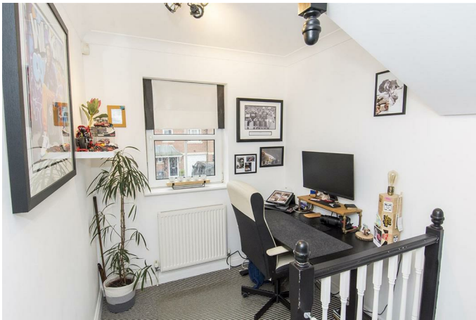
First Floor Landing/Study Area

Having a UPVC double glazed window to front aspect. Radiator. Storage cupboard. Doors off to: Living and Bedroom Three. Stairs rising to: First Floor