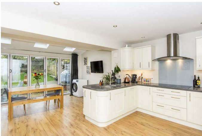
Kitchen/Living/Diner 22'8" x 16'2" (6.91 x 4.93)

The Kitchen area comprises: A selection of base and wall units with roll edge worktop and complimentary splash back. Integrated appliances include: A double electric fan assisted oven, five ring induction hob with extractor over, microwave, dishwasher and washing machine. There is also a space for an American freestanding fridge/freezer. To the living/dining area are bi-fold doors and three velux windows. There is wooden laminate flooring throughout and two radiators.