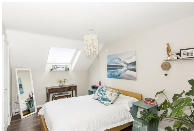
Bedroom One 14'8" x 9'4" (4.47 x 2.84)

Velux window to rear aspect. Radiator. Wooden laminate flooring.