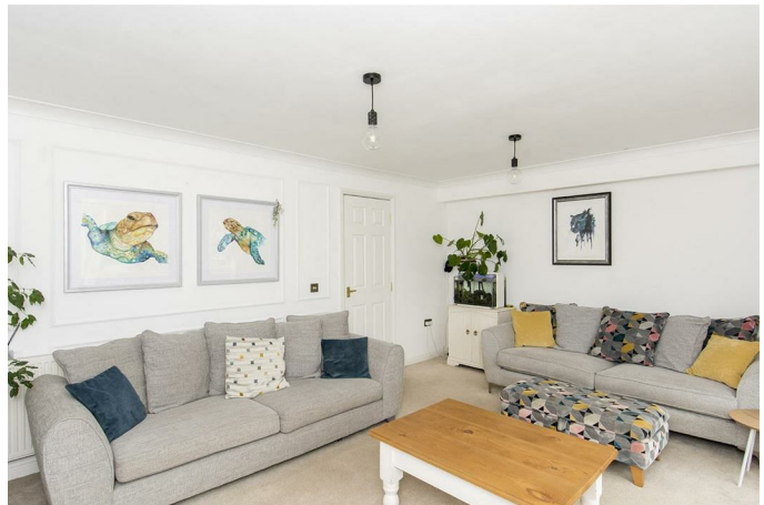
(Living Room Photo Two)

UPVC double glazed windows and single door onto terrace overlooking the rear garden. Radiator. TV point. Feature fireplace surround.