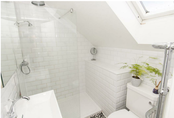
En-Suite 6'9" x 5'5" (2.06 x 1.65)

Re-fitted shower room comprising: Double walk in shower, hand basin and low level WC. Feature wall and floor tiling. Heated towel rail. Velux window to rear aspect.