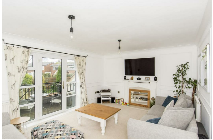
Living Room 16'5" x 12'2" (5.00 x 3.71)

UPVC double glazed windows and single door onto terrace overlooking the rear garden. Radiator. TV point. Feature fireplace surround.