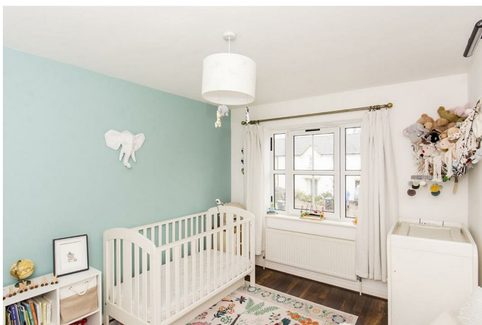
Bedroom Three 9'3" x 8'8" (2.82 x 2.64)

UPVC double glazed window to front aspect. Built in triple wardrobe. Radiator. Wooden laminate flooring.