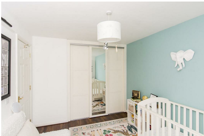
(Bedroom Three Photo Two)

Velux window to rear aspect. Radiator. Wooden laminate flooring.