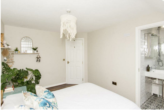
(Bedroom One Photo Two)