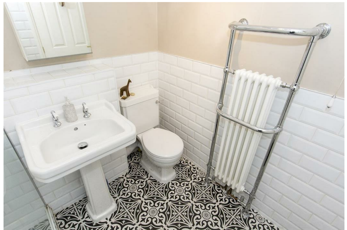
Family Shower Room 6'8" x 6'3" (2.03 x 1.90)

Re-fitted shower room suite comprising: Double walk in shower, hand basin and low level WC. Feature wall and floor tiling. Heated towel rail.